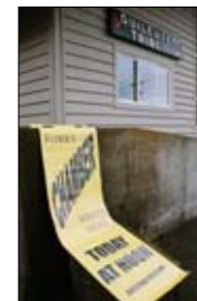
The Quileute Tribe is active in the Forks Chamber and hosts its meetings.