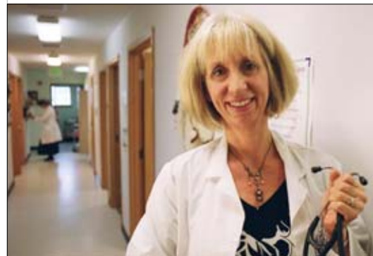
The Nooksack Tribe's health clinic is a new, 5,000-square foot primary care facility that also provides counseling and nutrition services, and dental care.