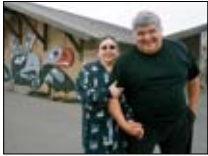
The Quileute Tribe operates a senior center in LaPush.