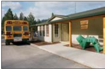
The Keller Head Start program is one of four early childhood education programs provided by the Colville Confederated Tribes.

When Sequim's primary health clinic closed in 2002, the Jamestown S'Klallam Tribe teamed with a group of physicians to open a new clinic under tribal ownership, providing about half of the primary care in the community.