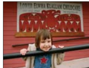
Lower Elwha Klallam Tribe provides licensed child care to eligible tribal member parents so they can attend school or work.