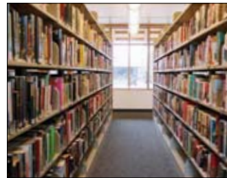
The Little Boston Library is one of the House of Knowledge projects. The library serves more than 25,000 patrons, tribal and non-tribal, each year.