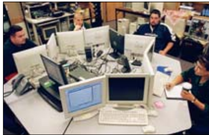
Students share a group lesson on skill building. The Muckleshoot Tribe is dedicated to excellence in education which includes emphasis on culture, history and language.