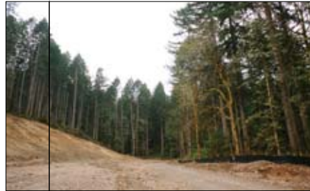
Road construction opens up land for a new Skokomish Tribe housing project.

With the support of the federal government and other tribes – including the Muckleshoot Tribe – the Hoh Tribe provides extensive youth activity programs.