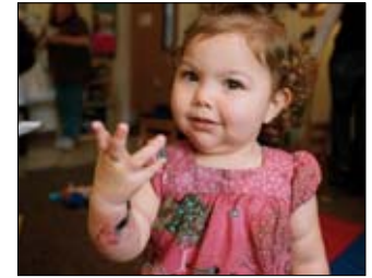
Port Gamble S'Klallam Tribe provides an array of child care and early learning services to support working families.