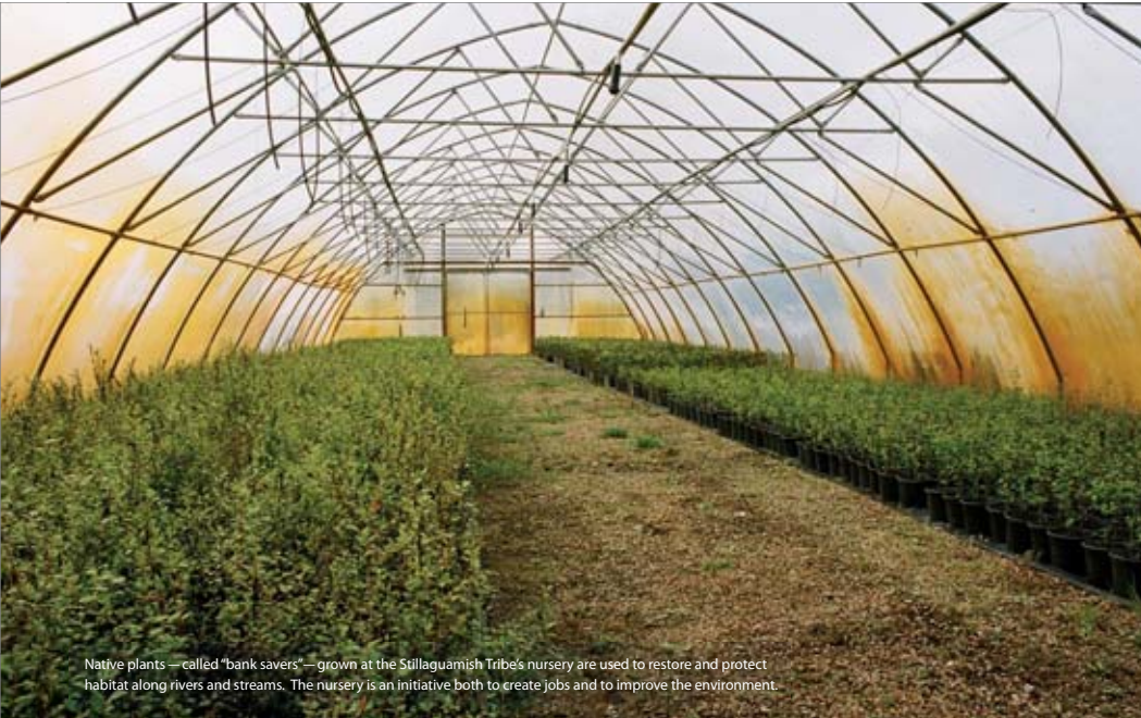
Native plants — called “bank savers” — grown at the Stillaguamish Tribe’s nursery are used to restore and protect habitat along rivers and streams. The nursery is an initiative both to create jobs and to improve the environment.

Washington tribes are investing tens of millions of dollars in environmental and natural resource programs.