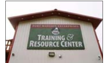
Suquamish Tribe's Port Madison Enterprises is one of the largest employers in Kitsap County with more than 780 employees. The new Training and Resource Center is being housed in an existing building that was acquired and is being remodeled and improved.