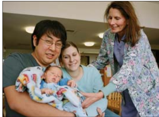
One of the newest members of the Swinomish Tribe visits the tribal health center.

Washington tribes made donations to 992 charitable organizations in 2006, according to latest Washington State government data. The money helped fund sports, educational, church, youth and community programs.