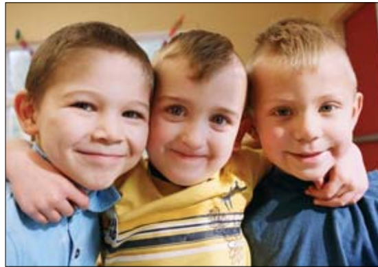
Skokomish Tribe Head Start buddies.