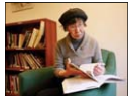
Nisqually Tribe's library.