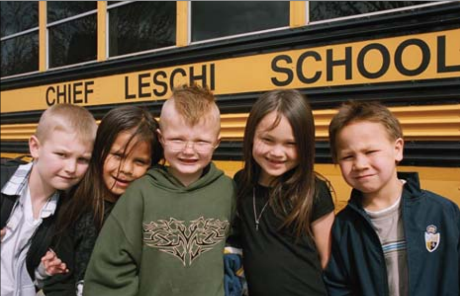
Puyallup Tribe's Leschi School is a modern 200,000 square foot facility intended to be a model for Native American programs around the country and show a glimpse into the future of educational technology for all educators. Students from 92 different tribes are among the approximately 700 enrollees in grades from pre-kindergarten through 12th grade.

Tribes place the highest priority on taking care of the young and elderly. They are building early learning centers, schools, senior centers, health clinics, homes, libraries and youth activity facilities throughout Washington.