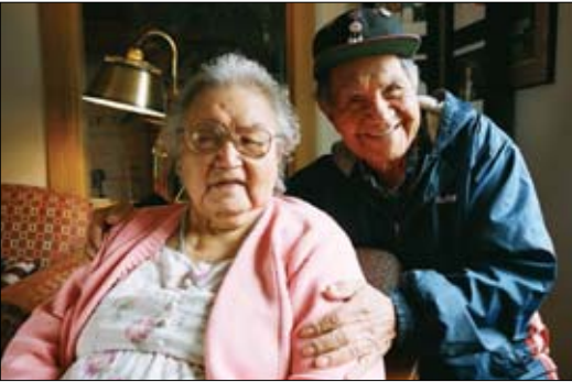
The Lummi Nation Senior Center provides meals, transportation and social activities.