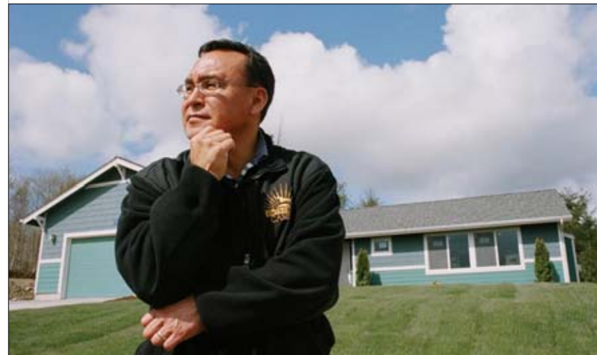
Forty-three new single family residences are being constructed in the Swinomish Tribe's Tallawhilt development.