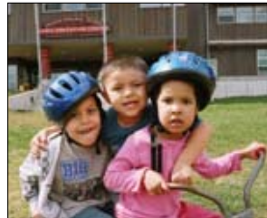
Many of Washington's tribes, including the Swinomish Tribe, place a high priority on early learning programs for children. The Swinomish Tribe invests more than $3.5 million in educational programs, including those to prepare children for kindergarten.