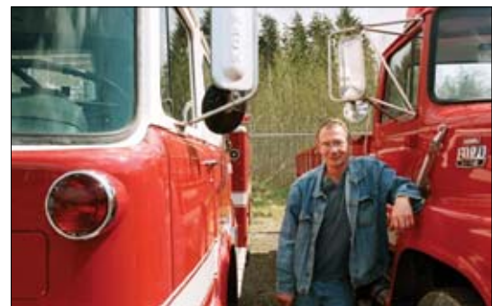
The Hoh Tribe provides fire protection and emergency services in western Jefferson County. Volunteers are being recruited and trained to provide services.