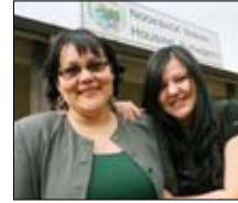
The Nooksack Tribe's Housing Authority is working to help tribal members become homeowners. New single family homes are currently under construction at the Rutsatz site.