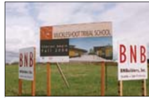
Muckleshoot Tribe is getting ready to begin construction of a new school and an early learning center.