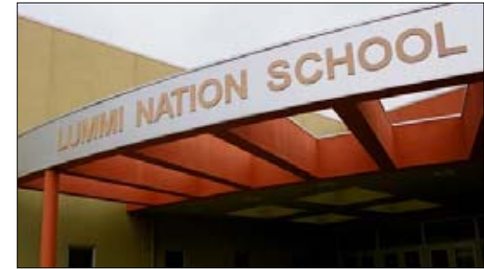
The Lummi Nation K-12 school is a modern educational facility located on a 90 acre campus within the reservation. Built in 2004 at a cost of $21 million, the school serves 750 students.