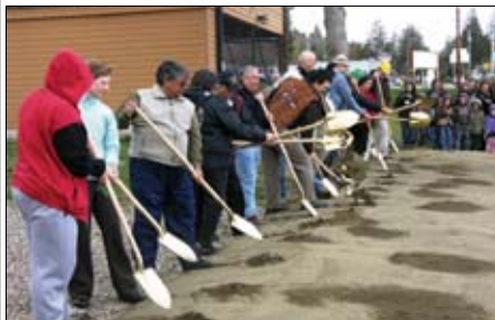
The Suquamish Tribe is constructing a Community House in traditional Salish Longhouse style near the waterfront on the Port Madison Indian Reservation. The Community House is part of a larger revitalization campaign that includes a new museum and arts center, a new dock in the downtown district, increased community housing, a ball field, refurbishing Chief Seattle's Grave and a trail system. A new early learning center is also part of the campaign and was completed last year.

Washington tribes invest more than $140 million in health and education programs, contribute approximately $9 million to charitable organizations in their communities, and give millions of dollars to local governments and agencies to offset the cost of providing services.