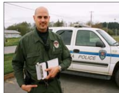
Lower Elwha Police coordinate with their counterparts in local, county, state and federal law enforcement agencies.