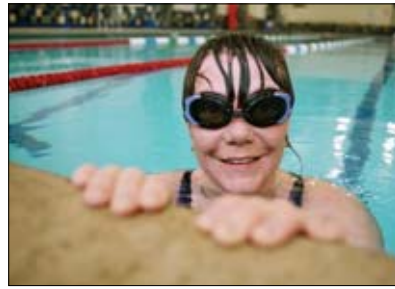
Children to seniors enjoy the Kalispel Tribe's new Camas Center for Community Wellness. Residents throughout Pend Oreille County and beyond, tribal and non-tribal alike, benefit from this new $20 million facility.